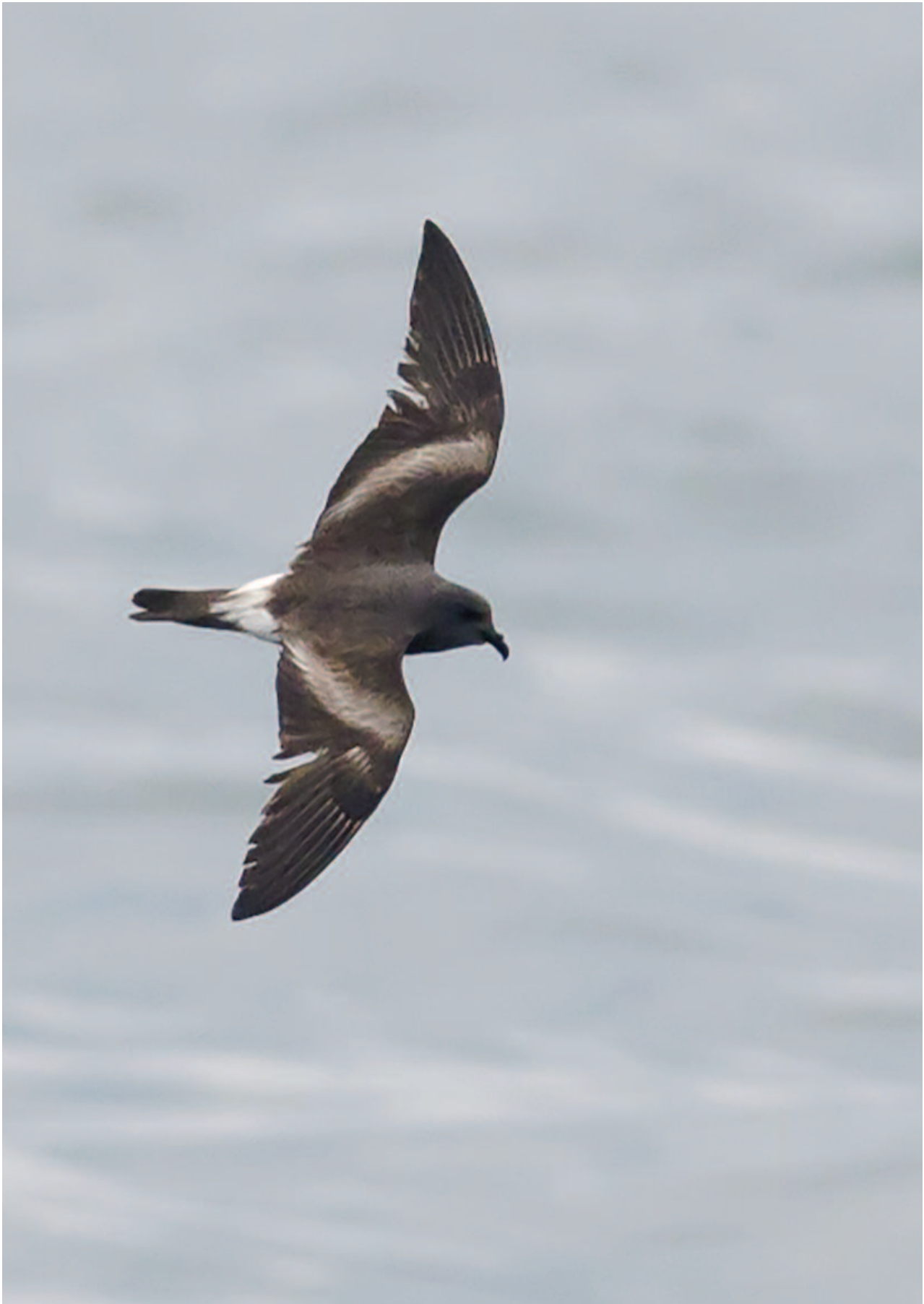
Figure 2. Adult Leach's Storm Petrel Oceanodroma leucorhoa off Bon Portage Island.