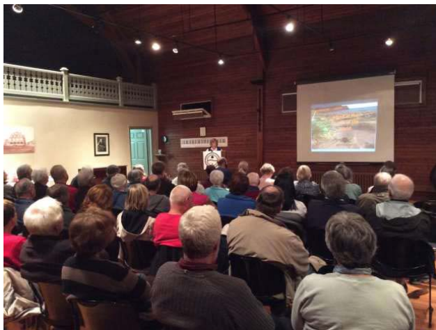
An excellent crowd at the presentation at Beaconsfield House, Charlottetown, hosted by Nature PEI.

Wednesday October 15th (11:15 a.m.) St. FX Geology Department, Antigonish: Well attended with audience of over 80 people.